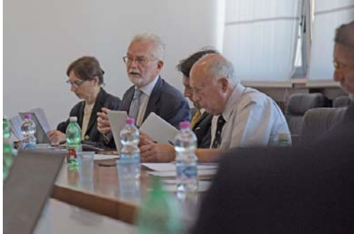
Meeting of the TC-TF Presidents, Vice Presidents and Secretaries

held in May 2019. The use of PIARC on-line manuals in Italy and the possibility of producing versions in Italian were also discussed with the technical committees concerned. Finally, Italian experts discussed participation in the next World Road Congress in Abu Dhabi, soliciting responses to the Call for Papers of the PIARC General Secretariat on 31 May and the indication of sponsors for the construction of the stand.