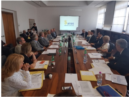
Italian National Committee meeting