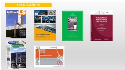
The first publications of the e-book series "The roads of the future"