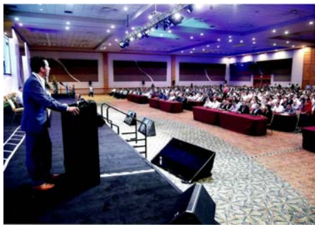
Opening session, XXII National Roads Meeting