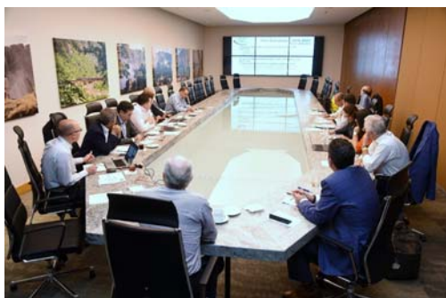
Mexican members within PIARC Technical Committees and Task Forces

Each member presented all the activities that have been made by their TCs and TFs highlighting the progress achieved during this work cycle (2016 - 2019). The contribution of each Technical Committee to the preparation of the next Strategic Plan 2020 - 2023 was also appreciated. In the end, all the participants agreed to gather again prior to the World Road Congress.