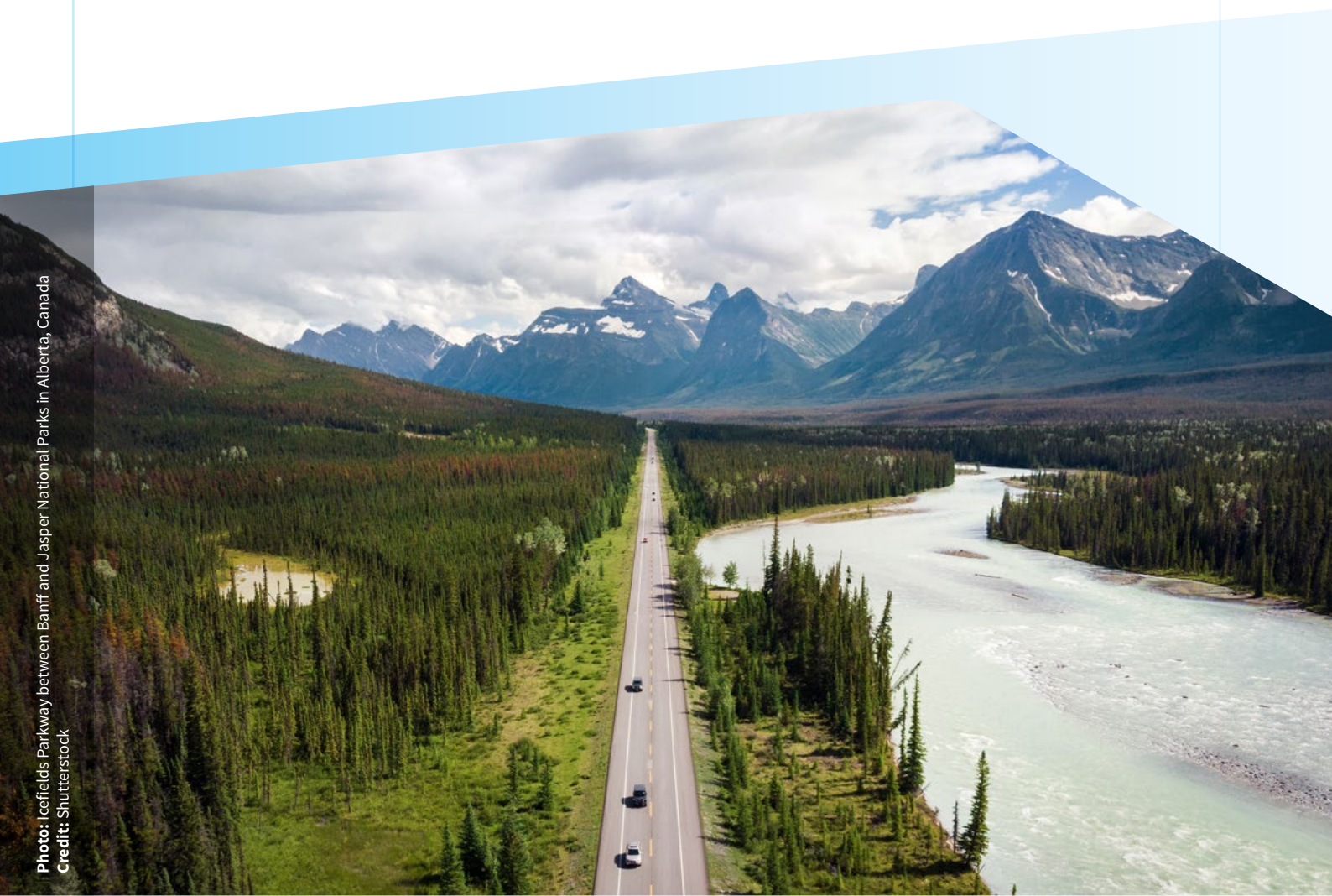
Photo: Icefields Parkway between Banff and Jasper National Parks in Alberta, Canada