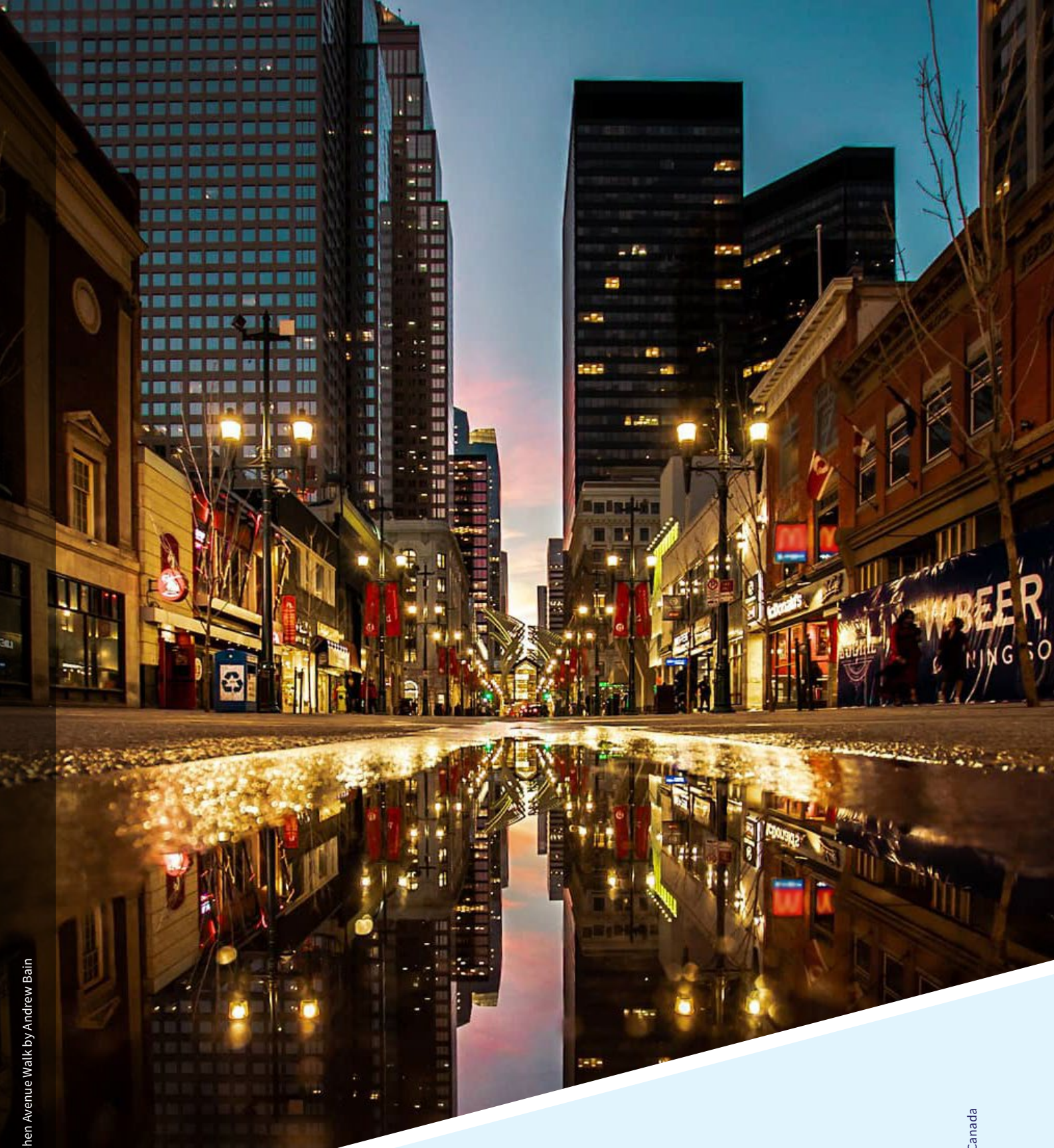
Photo: Stephen Avenue Walk

© Her Majesty the Queen in Right of Canada, as represented by the Minister of Transport, 2020.