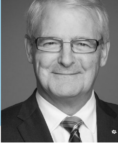
MINISTER OF TRANSPORT The Honourable Marc Garneau

Canadians know winter. From the passes through the Rocky Mountains to the coastal Atlantic provinces and all points in between, including the tundra in our territorial north, Canadians have had to adapt to winter and the challenges the season brings.